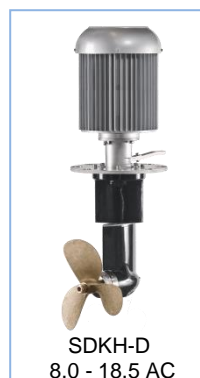
SDKH-D 8,0 - 18,5 AC