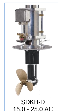
SDKH-D 15,0 - 25,0 AC