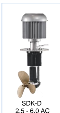
SDK-D 2,5 - 6,0 AC

The heart of the system is the electric motor. The drive must work powerful, reliable, quiet and maintenance-free. For Krätzler Sail-Drive only maintenance-free AC technology is used. This technique is characterized by a very long life and is robust to adverse environmental conditions.