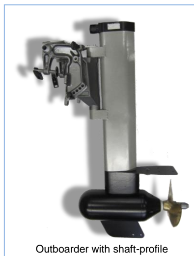
Outboarder with shaft-profile

The Kräutler Outboarder: powerful, quiet and reliable. But every ship is different! We have developed a wide range of brackets and mounting options for the requirements on your boat. Whether mounting on the straight stern, in the engine bay or for mounting at a rudder gland under your ship, Kräutler has the right drive. The leading e-boat manufacturer in Europe confidence our technology, you can also benefit from our decades of experience.