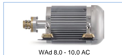
WAAd 8,0 - 10,0 AC