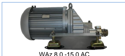
WAZ 8,0 - 15,0 AC