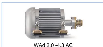
WAAd 2,0 - 4,3 AC

For electric motors constructed ships have in the rarest cases, a shaft drive system, because the powertrain require much space and the installation of the shaft system is complex. However, the modification of an existing system is always a challenge that can be implemented with a shaft drive of Kräutler. Whether sail or motor boat, whether daysailer or passenger ship, the possibilities are diverse and the demands on the systems highly. Kräutler has the right solution for our boat.