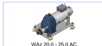
WAZ 20,0 - 25,0 AC