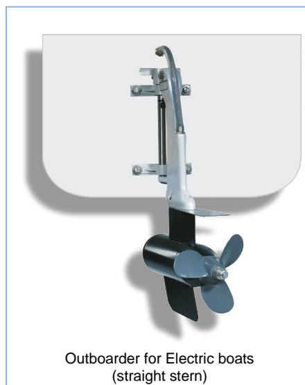
Outboarder for Electric boats (straight stern)

The Kräutler Outboarder: powerful, quiet and reliable. But every ship is different! We have developed a wide range of brackets and mounting options for the requirements on your boat. Whether mounting on the straight stern, in the engine bay or for mounting at a rudder gland under your ship, Kräutler has the right drive. The leading e-boat manufacturer in Europe confidence our technology, you can also benefit from our decades of experience.